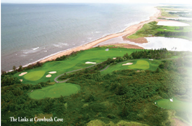
The Links at Crowbush Cove